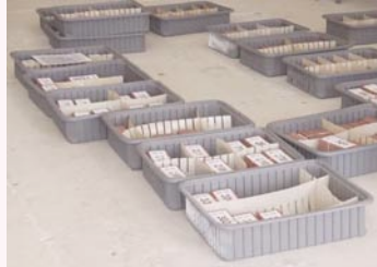
Here some of the 41 tubs full of new tiles ready to go.