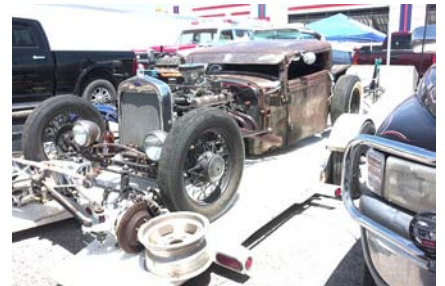
A neat Rat Rod