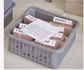
Each tub contains tiles for specific blocks and a laminated map for exact tile count and field position