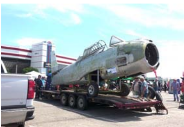
A jet trainer, sold first day.