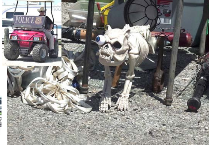
A highly trained guard dog protected the vendor's stuff.