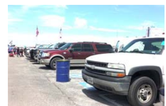
A thousand pickup trucks, everywhere.