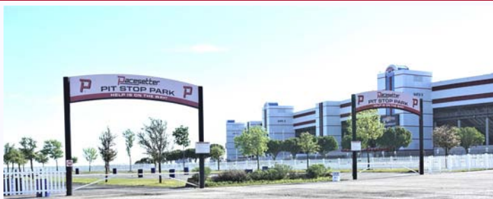
Pit Stop Row, outside Speedway gate 4 on Petty Street, is what we commonly call the "Pet Cemetery." It makes it an easy reference.

After all our planning and preparation it was time to put the pedal to the metal and get the PATE Swap Meet ready to operate. We met by the Pate Pet Cemetery zipped out with ten golf carts to our storage Conex, loaded up the tile tub and street signs from storage and ventured out to set the place up. The day was sunny and mild, but the ever-present wind was always there.