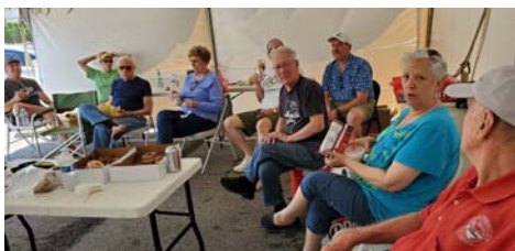
NTX and HCCA crews celebrating a job well done. Mission Accomplished.