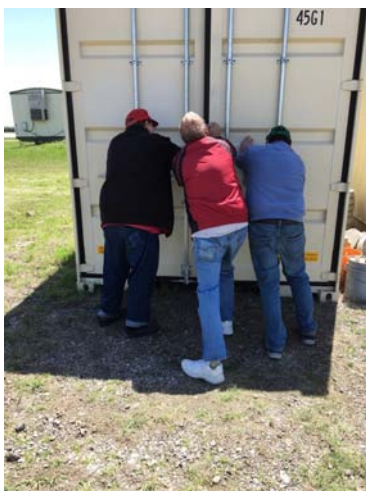
Time to close the door on this years Pate Swap Meet. Ready for next year.