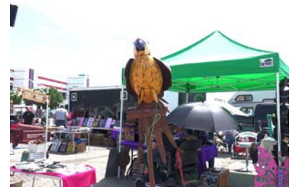
More crazy stuff