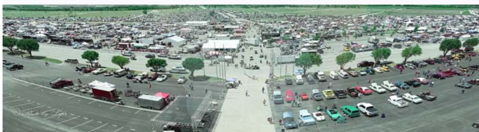
One view of the swap meet underway. The cars on the right are in the car corral, all for sale.